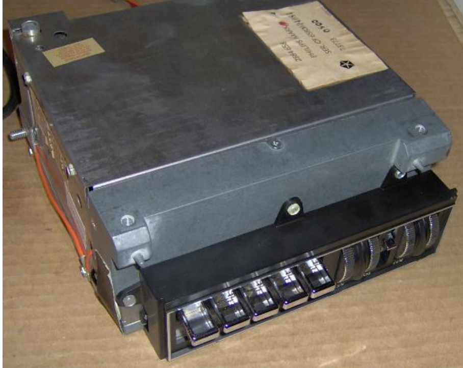
This is the bottom side of a 1970 Phillips AM FM # 2884658 . Notice the Antenna port is located on the bottom of the radio . This holds true for ALL E body radios 1970-1974 . Also note the unique location of the mounting bolt holes at the bottom front of the radio .